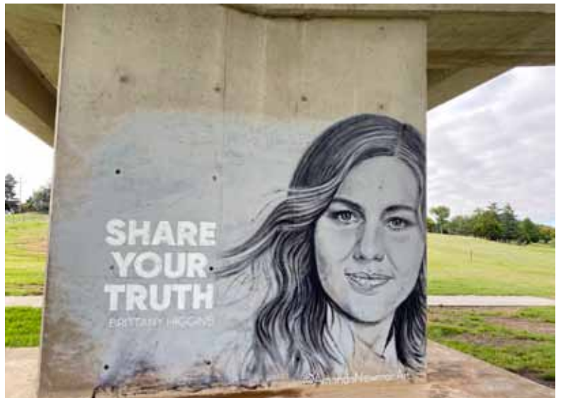
One of Amanda Newman's wall art on the Goulburn walking track along the Wollondilly River in Tully Park Golf Course.

Source of article: https://www.facebook.com/AmandaNewmanArt/