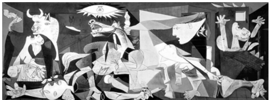
"Guernica" by Pablo Picasso.

Hannah Höch, Cut with the Kitchen Knife Dada Through the Last Weimar Beer-Belly Cultural Epoch of Germany, collage, mixed media, 1919–1920 (Nationalgalerie, Staatliche Museen, Berlin)