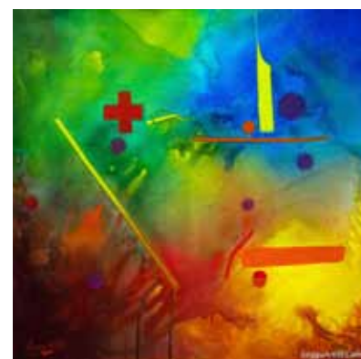
Sukhvinder Saggu. Puzzling Pandemic . Acrylic, 50x50cm.