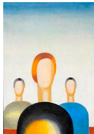
The original painting Three Figures by Anna Leporskaya is on display at The Yeltsin Centre in Ekaterinburg, Russia. Credit: AZ/AP The original painting Three Figures by Anna Leporskaya is on display at The Yeltsin Centre in Ekaterinburg, Russia. Credit: AZ/AP

Source: https://7news.com.au/news/world/security-guard-touches-up-1-million-painting-by-drawing-eyes-on-it-with-ballpoint-pen-at-russian-gallery-c-5653867