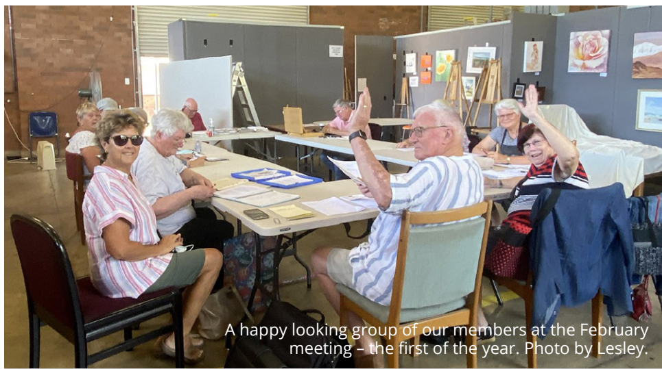
A happy looking group of our members at the February meeting – the first of the year.