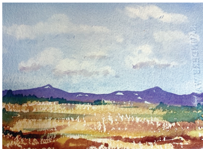
Helen's watercolour examples for her workshop.