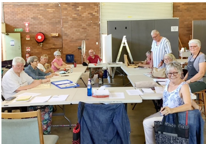
Meeting Day, February 2022.

https://quotesguides.com/funny-art-quotes/