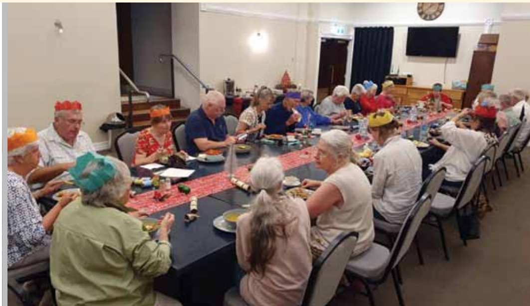
Christmas lunch on 3rd December 2024 at the Goulburn Workers Club.

Our Constitution - download at https://www.fairtrading.nsw.gov.au/_data/assets/word_doc/0018/1102491/Model-Constitution-for-Associations-2022-3.docx