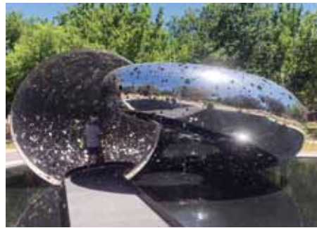
Lindy Lee. Ouroboros . 2021-24. Stainless steel.