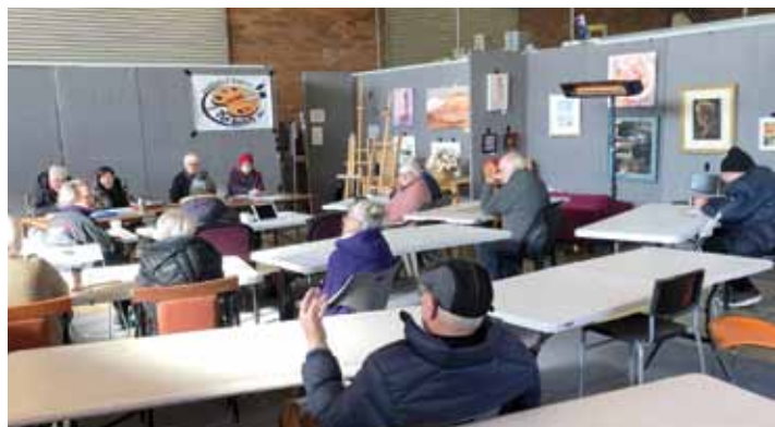
Last GDAS Committee meeting in June.