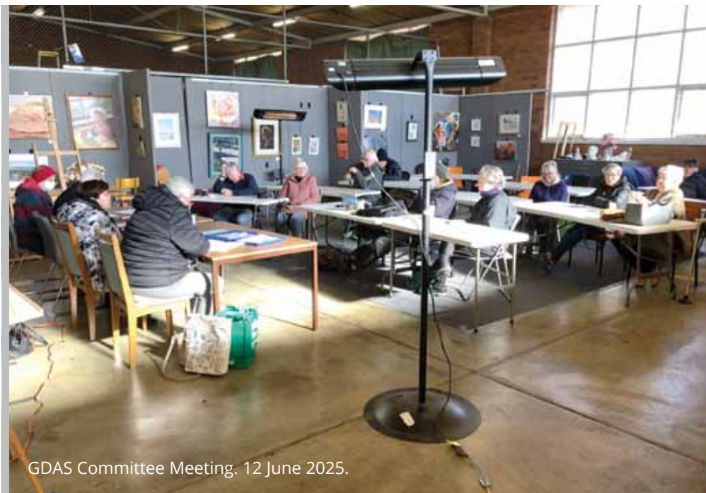
GDAS Committee Meeting. 12 June 2025.