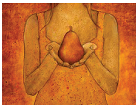
EXHIBIT & SELL YOUR ARTWORKS AT OZARTFINDER

VISITORS ARE ALWAYS WELCOME BRING AN INTERESTED FRIEND TO A THURSDAY PAINTING DAY ENCOURAGE PEOPLE TO JOIN GDAS