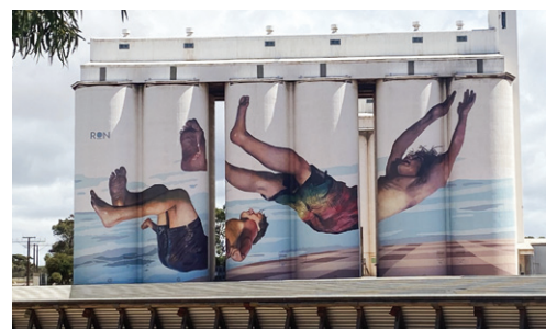
Silo art at Tumby Bay.

Do you know of someone who would be an interesting guest speaker for one of our meetings? If so, please let us know and we shall endeavour to arrange it.