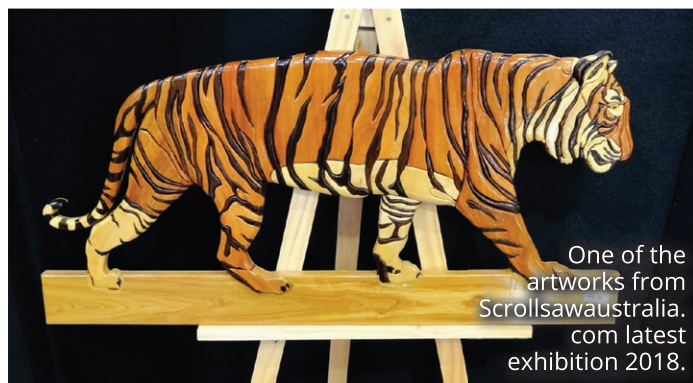
One of the artworks from ScrollsaAustralia.com latest exhibition 2018.