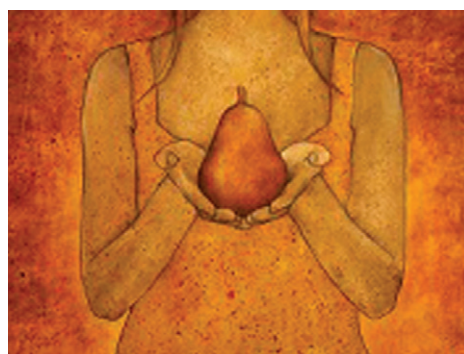
EXHIBIT & SELL YOUR ARTWORKS AT OZARTFINDER

BDCU Alliance Bank, BSB 802101 Acc 100075612 Reference: Surname + Initials Alternatively post a cheque to The Treasurer, GDAS, P.O. Box 71 Goulburn NSW 2580