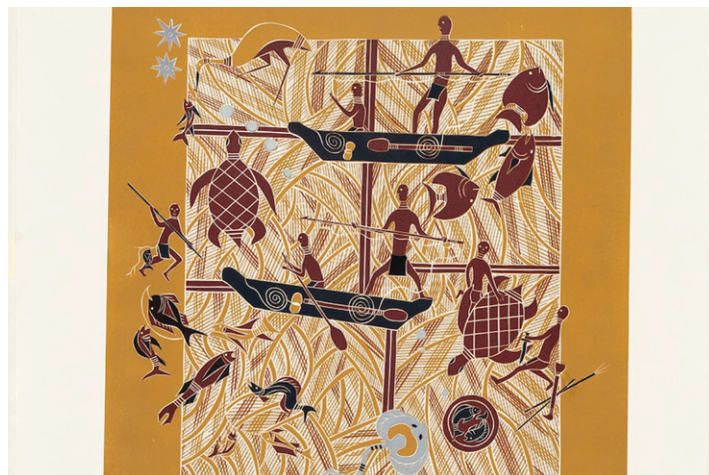
This artwork - Rirratjingu people, Miyapunuwu Ngarrungan (Turtle hunting Bremer Island) - is in the National Gallery of Australia.

Dr B Marika AO, a Yolngu woman who grew up in Yirrkala in north-east Arnhem Land, was among the first women to be encouraged by male relatives to paint ancestral creation stories, a tradition previously reserved only for men.