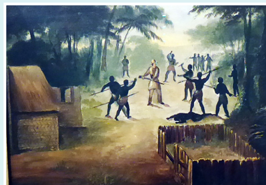
Unknown Artist. Aboriginal Raid on Milton Farm, Great Swanport, Tasmania.