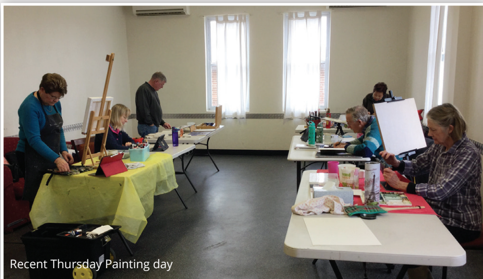
Recent Thursday Painting day