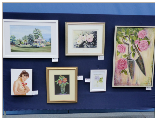
2019 Rose Festival Exhibition, Rose-themed section.