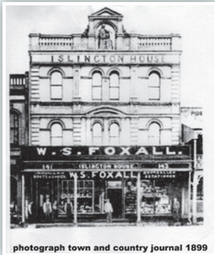
Islington House in 1899.

First organised art classes in Goulburn were commenced above Foxall's Music Warehouse in Auburn St, opposite Belmore Park in 1897 - the beginnings of forming our Art Society in Goulburn.