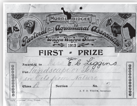
Certificate, collection of Lynette Brown.

“Have no fear of perfection, you'll never reach it.” Salvador Dalí