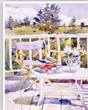
Deck Chair, Baccaro, Nova Scotia. 2005, watercolor, 24 x 20. Private collection.

By just looking at his works we might wonder how to reshape our own mind to achieve the same luminosity and harmony - of course if you like such style.