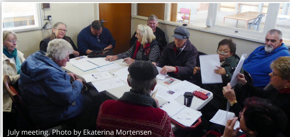
July meeting.