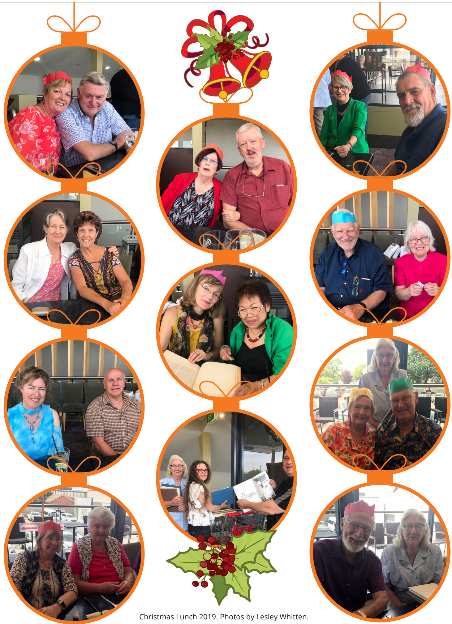
Christmas Lunch 2019.