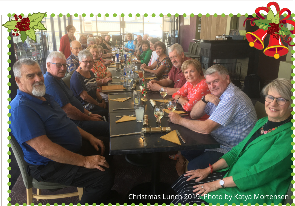
Christmas Lunch 2019.