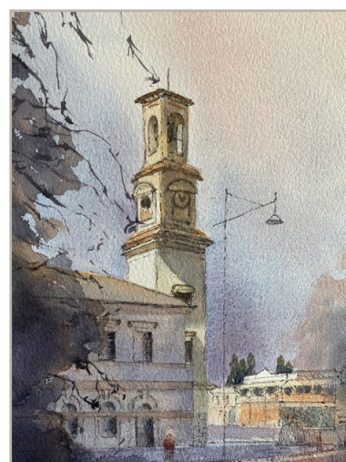
Watercolour by Lesley Whitten