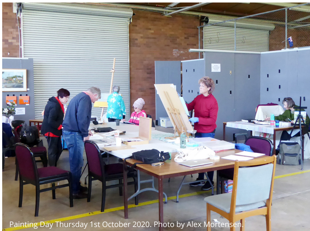
Painting Day Thursday 1st October 2020.