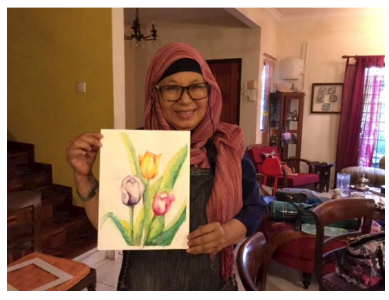
A very pleasing result by one of the participants.