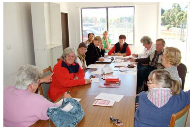
Our first meeting in the Art Shed

Sign the book and put $2 into the box to cover tea/coffee, heating.