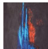
Immolation, 2014 Acrylics 61x91cm $300 Enquire