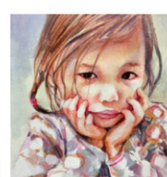
Little Girl 2021 watercolour 21x29cm (unframed) $110 Enquiries