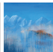
High Peaks, 2020 Acrylics, 51x91cm $300 Enquire

The STA Gallery is a dedicated digital display space where our visitors can experience diverse and inspiring exhibitions. The online program is curated to showcase the amazing works of art being produced across our region and the extraordinary Artists who create them.