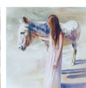
Just Friends 2021 watercolour 39x56cm (unframed) $450 Enquiries