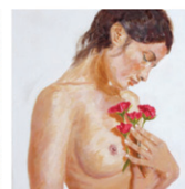
Nude Girl with Flowers, 2018 Acrylics 31x40cms $200 Enquire