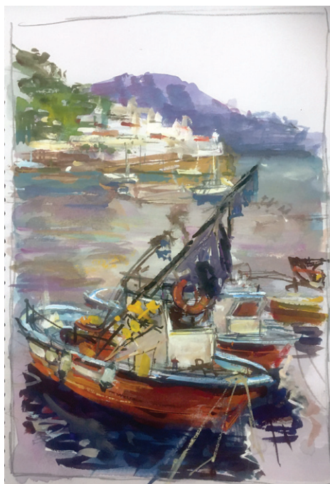
Stavros Papantoniou. Watercolour sketch.