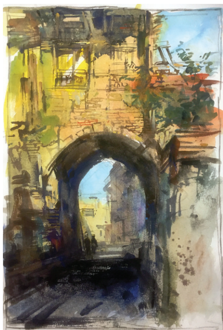
Stavros Papantoniou. Watercolour sketch.