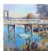
Old Lansdowne Bridge 2021 acrylics on paper on board 35x26cm $150 Enquiries