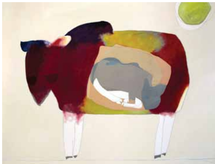
Nadja Kirschgarten. Content and Form.

Here are three examples from the site. Two of them are using paint and the third, by Morag Keil, has a variety of materials showing how one can be very imaginative in what you use to create the art.