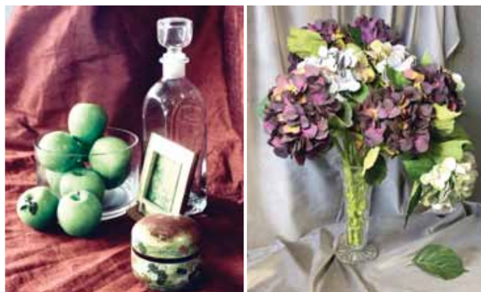
Photo: Still Lifes 1 and 2.