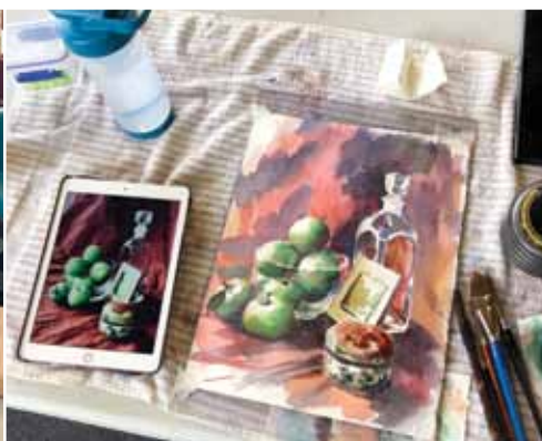
Katya's still life in progress.