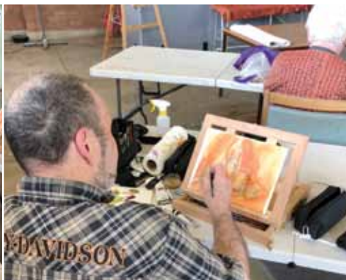
Noel's still life in acrylics comes to life.