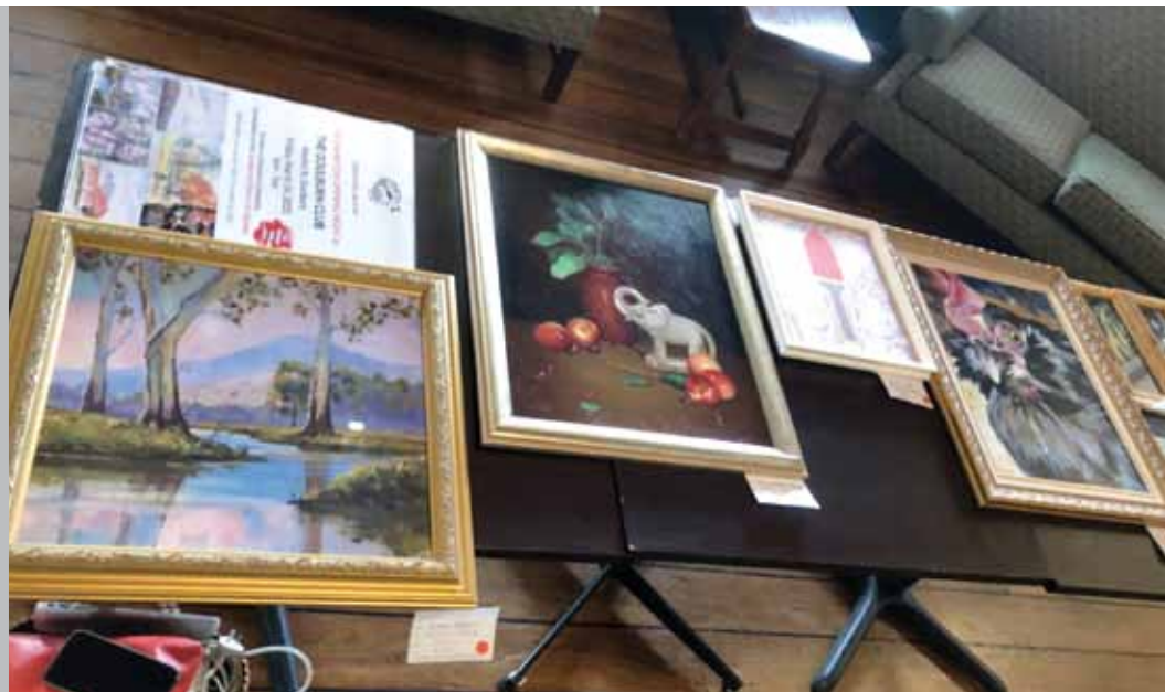
Sold paintings at the Goulburn Club Exhibition, waiting for their new homes. Congratulations to the artists!

Our Constitution - download at https://www.fairtrading.nsw.gov.au/_data/assets/word_doc/0020/1143605/Model-Constitution-for-Associations-2024-5-31.docx