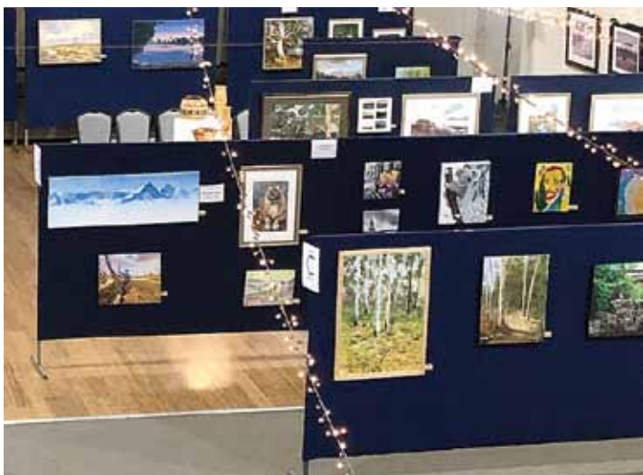
EXHIBIT AT THE LOADED DOG HOTEL, TARAGO - A WONDERFUL OPPORTUNITY

Remember to read through the terms and conditions in the entry form that is currently getting updated by our exhibition committee.