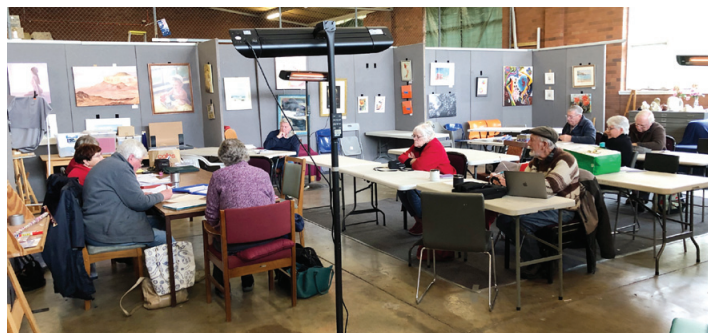
Meeting on 9th October.