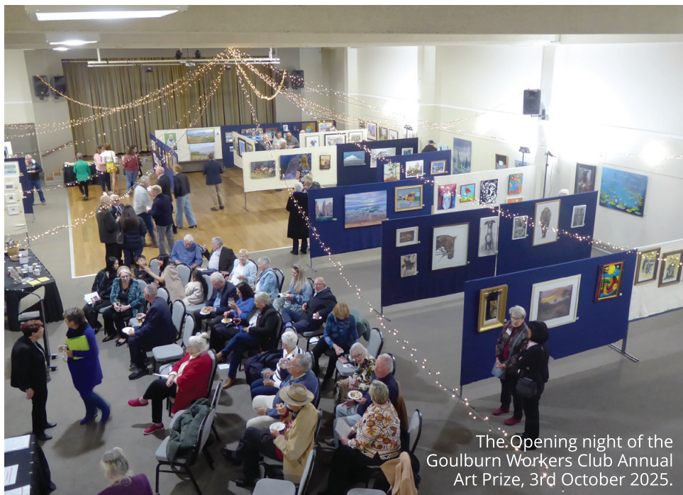
The Opening night of the Goulburn Workers Club Annual Art Prize, 3rd October 2025.

Our Constitution - download at https://www.fairtrading.nsw.gov.au/_data/assets/word_doc/0020/1143605/Model-Constitution-for-Associations-2024-5-31.docx