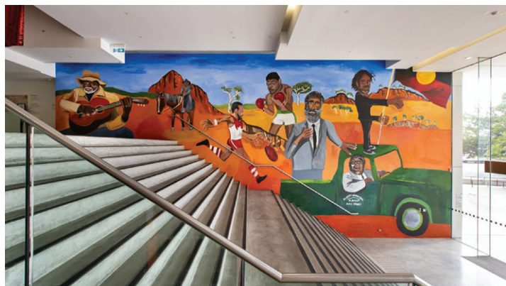
Vincent Namatjira, P.P.F. (Past-Present-Future), 2021, synthetic polymer paint, commissioned by the Museum of Contemporary Art Australia, 2021.