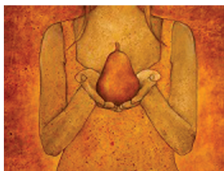
EXHIBIT & SELL YOUR ARTWORKS AT OZARTFINDER

VISITORS ARE ALWAYS WELCOME BRING AN INTERESTED FRIEND TO A THURSDAY PAINTING DAY ENCOURAGE PEOPLE TO JOIN GDAS