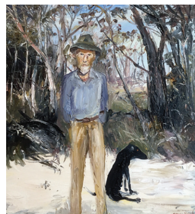
Arthur Boyd. Professor Manning Clark at Wapengo NSW , 1972.