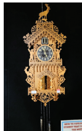
Artworks from Australian Scroll Saw Network exhibition at MITCHAM SA, 2018.