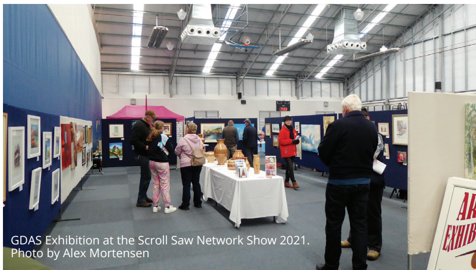
GDAS Exhibition at the Scroll Saw Network Show 2021.