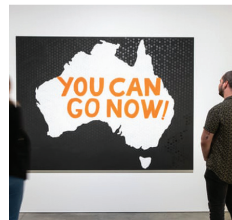
Immigration Policy (2017) by Richard Bell.