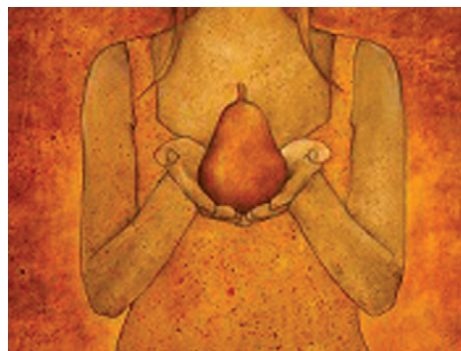
EXHIBIT & SELL YOUR ARTWORKS AT OZARTFINDER

BDCU Alliance Bank, BSB 802101 Acc 100075612 Reference: Surname + Initials Alternatively post a cheque to The Treasurer, GDAS, P.O. Box 71 Goulburn NSW 2580