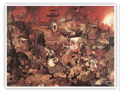
Pieter Bruegel, Dulle Griet [Mad Meg].1562 www.pieter-bruegel-theelder.org