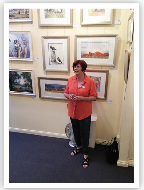
The exhibiting artists at the opening.