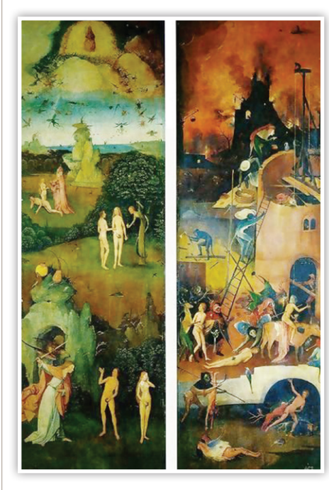
Jhieronymus Bosch, The Hay Wain, 1516. Left and right wings.