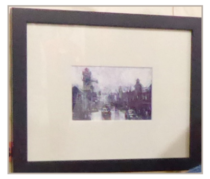
Section E (MINIATURES) 1st: Stavros Papantoniou, "Goulburn in the Rain"