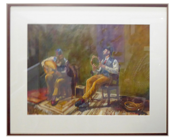
Section C (ACRYLICS) 1st: Stavros Papantoniou, "Tooadro Brothers"