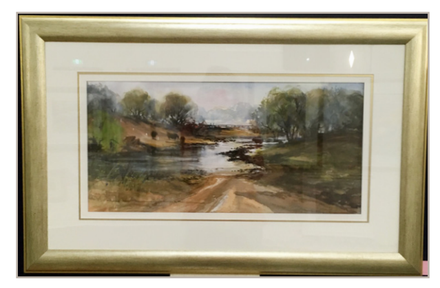
Section B (WATERCOLOUR / PEN & WASH) 1st: Noeline Millar, "The River Crossing"