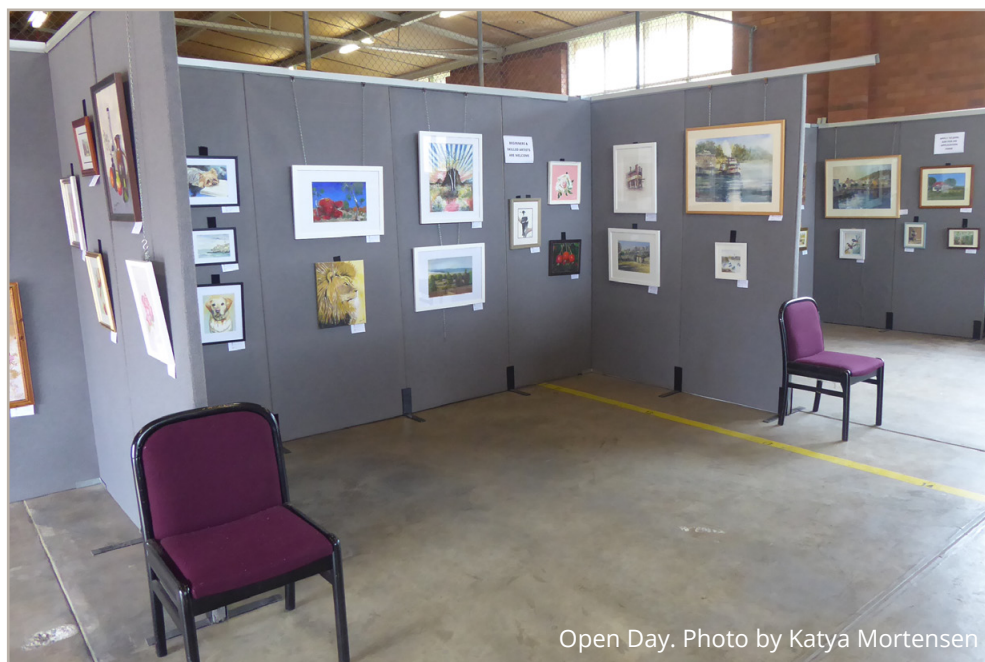
Open Day.