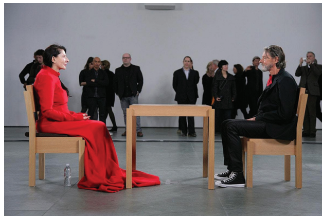
Marina Abramović. "The Artist is Present", 2010. Source: theartnewspaper.ru

*Source: https://archive.com/publications/3518~12_worldfamous_live_art_performances_by_Marina_Abramovi Accessed Nov 13, 2020.