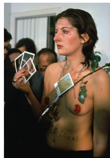
Marina Abramović. "Rhythm O", 1974. Source: theartnewspaper.ru