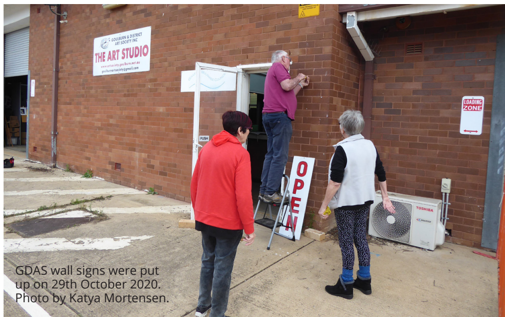
GDAS wall signs were put up on 29th October 2020.